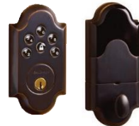
DEADBOLT WITH KEYPAD