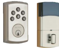
DEADBOLT WITH KEYPAD